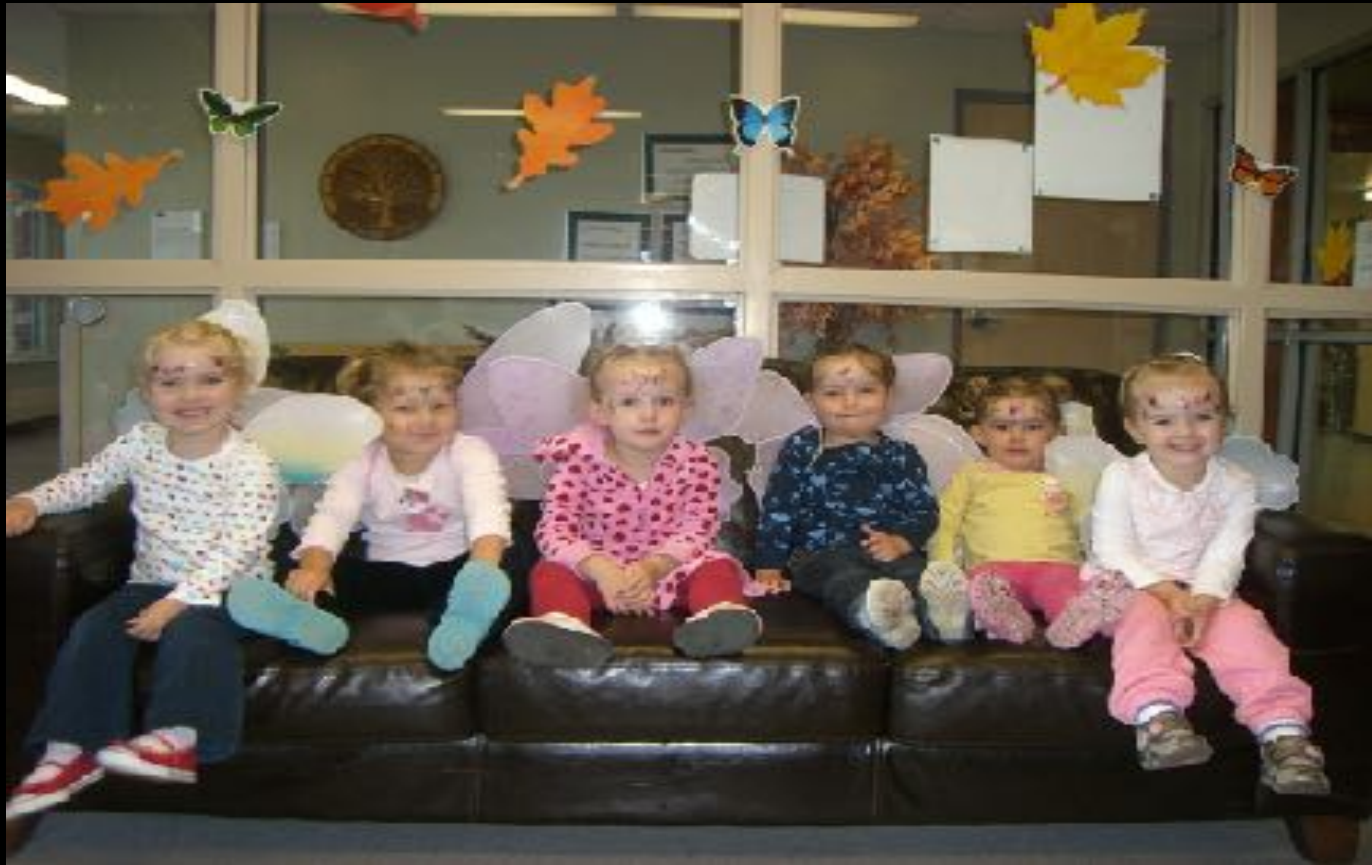
Oak Trees and Acorns Child Care Centre (opened in 2000)